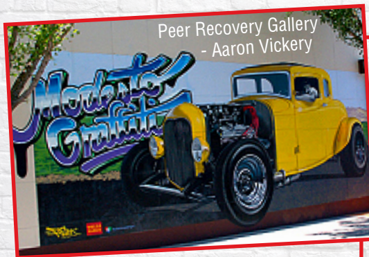
Neville Bros - Tom Nye

One of the most beloved classic cars is the '57 Chevy Bel Air. The tail-fins are a masterpiece and the chrome and the design makes a statement that still stands tall today. Two of our murals feature this classic car and there will be more to come. The giant headlights of a '57 adorn the walls of the Modesto Chamber of Commerce and at McHenry Village.